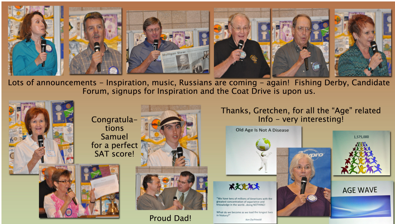
Lots of announcements – Inspiration, music, Russians are coming – again! Fishing Derby, Candidate Forum, signups for Inspiration and the Coat Drive is upon us.