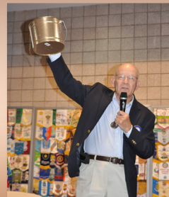
Dale asks for 3 min. acts for the year-end show and suggests a possible one for Dan Pedry.