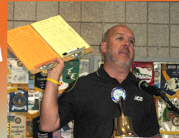
Need more volunteers for park cleanup at Roger's Grove