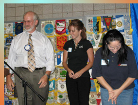
Donation to coat drive of over $8,000 worth of coats from Infinity Gear!